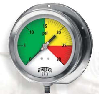
Gauge with custom dial (coloured zones for quick visual indication)